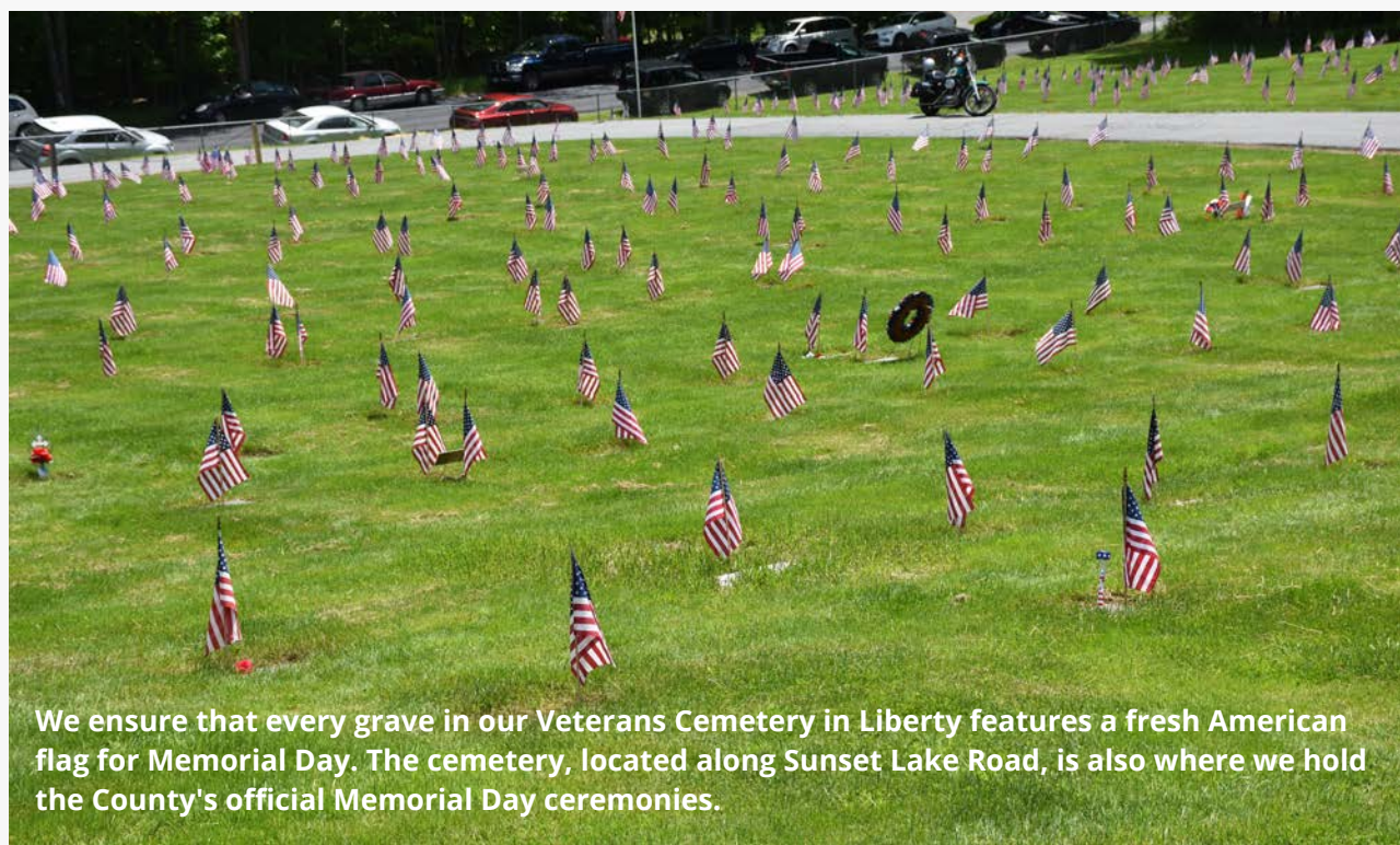
We ensure that every grave in our Veterans Cemetery in Liberty features a fresh American flag for Memorial Day. The cemetery, located along Sunset Lake Road, is also where we hold the County's official Memorial Day ceremonies.