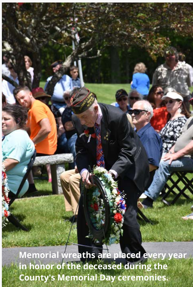
Memorial wreaths are placed every year in honor of the deceased during the County's Memorial Day ceremonies.

It's been said that Veterans Day is for the living and Memorial Day is for the dead. In one sense, that's true, as we honor living veterans on Veterans Day and deceased veterans on Memorial Day. But Memorial Day is about the living, too. Without us - the living - paying homage to our passed vets, Memorial Day would not have any meaning. I've been honored to share thoughts at several Memorial Day events, but what was most important to me and other speakers is that there were people present to listen. They attended to be a part of something special, to remember those who served, and to reflect on why and how they served. Memorial Day should not solely be about the start of summer, the return of warmer weather and vacation trips. Our veterans did not pledge - and sometimes give - their lives in defense of our freedoms just for us to lounge in the sun. They hoped to make a difference, and to give us a chance to do the same. So I encourage and invite you to join me and thousands of others this May 30 in taking just an hour or two to solemnly give thanks at one of the local ceremonies. The complete list will be posted in local media and at www.sullivanny.us .